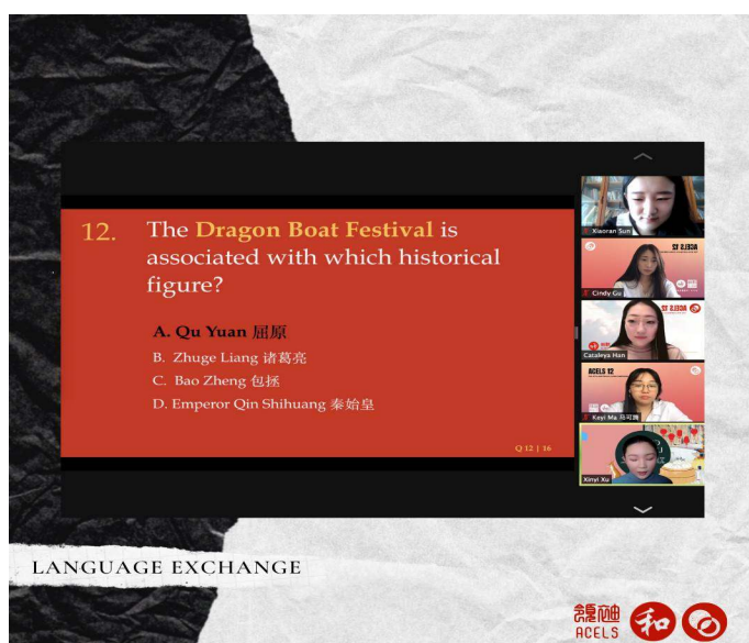
Capture from the Australia-China Emerging Leaders Summit

The Foundation is a major sponsor of Australia's leading youth groups focussing on the Australia-China relationship. The Australia-China Youth Association (ACYA) and the Australia-China Youth Dialogue (ACYD) are at the forefront of building understanding and enhance enduring people-to-people links. Their respective annual events bring together young Australian and Chinese participants to discuss Australia-China engagement while forging long lasting connections. The Foundation was the principal supporter of ACYA's Australia-China Emerging Leaders Summit (ACELS) in January 2021.