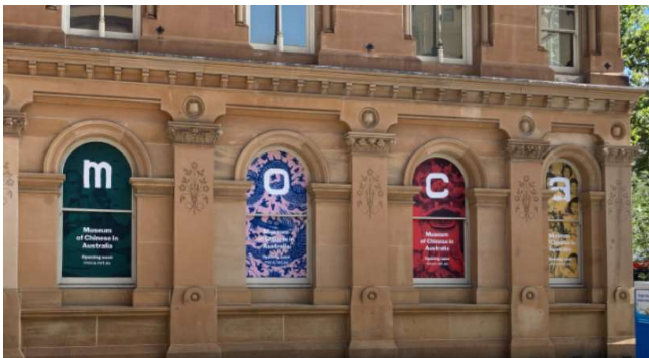
Future site of the Museum of Chinese in Australia, Sydney

The Foundation is mandated to showcase Australia's diverse communities. Through its grants program in 2020-21 the Foundation supported the founding of a new museum located in Sydney that will highlight the contribution of Chinese Australians to the Australian story.