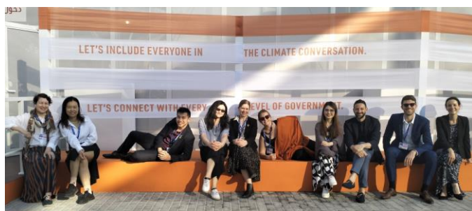
Australian participants at COP28UAE.