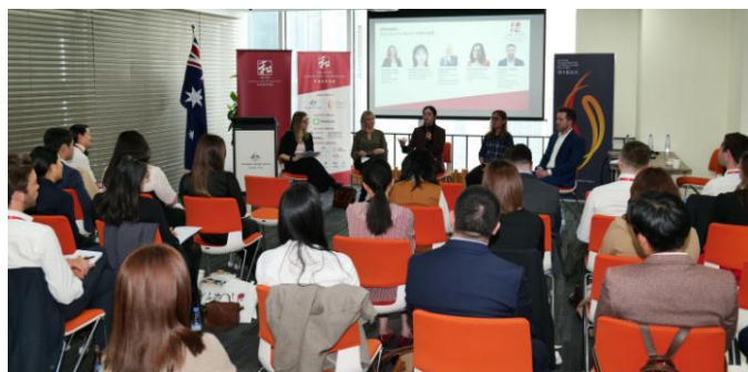
Delegates of the 13 th ACYD in Chengdu, China

The ACYD aims to position professionals from a range of backgrounds to be active, visible and constructive figures in Australia and China affairs. Read more about the 13th ACYD from its organisers here , delegates here or from Chengdu's Foreign Affairs Office here .