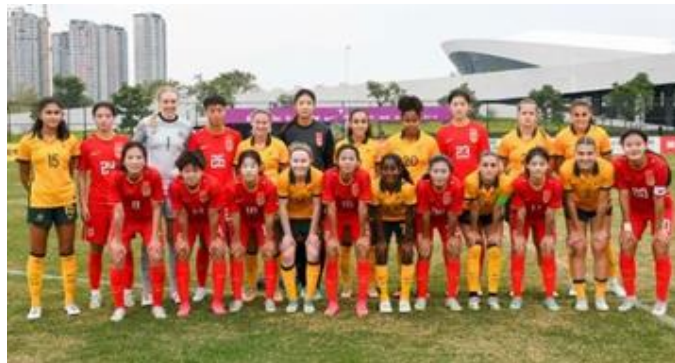
The Young Matildas with their Chinese counterparts in Xiamen.

Football Australia highlighted these events on their website and LinkedIn .