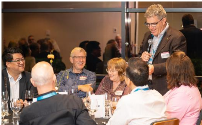
ATEC's CEO Forum at the National Wine Centre, Adelaide.

The Foundation supported ATEC's China Host training program as part of the Government's broader efforts to support Australian businesses by building China literacy and capability in the tourism sector.