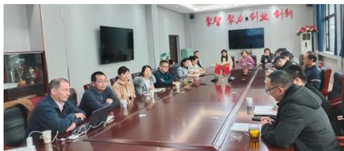
The Victoria University workshop held in Nanjing.

collaboration in this area a positive example of constructive engagement. Dialogues on climate change issues also support the joint outcomes statement from the annual China-Australia leaders meeting.