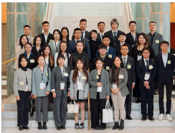
Inaugural 2023 Stephen FitzGerald Scholars Program participants.