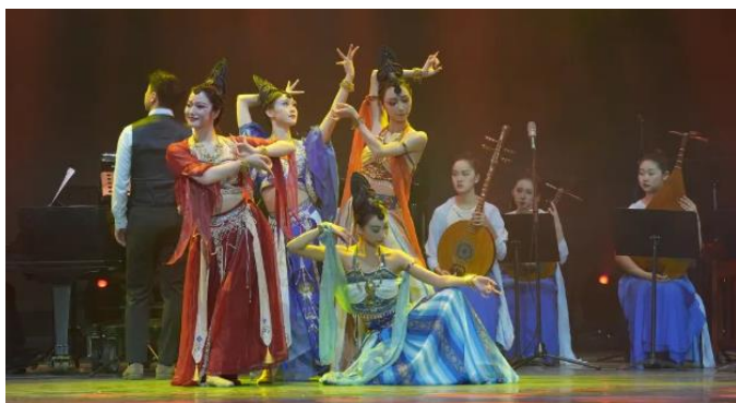
A suite of concerts and workshops in Nanjing featuring WAAPA staff in collaboration with Nanjing students.