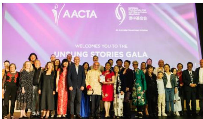
Attendees of the Unsung Stories Gala held at the Ritz Cinemas Randwick.

The Australian Academy of Cinema and Television Arts (AACTA) held the Unsung Stories short film festival in Sydney on 9 October. The event saw Chinese Australians from a variety of backgrounds share their stories on the big screen, in celebration of Australia's diverse communities and their contributions to our country.