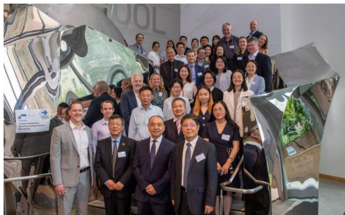
Participants at the UTS:ACRI event.

The Australia China Relations Institute at the University of Technology Sydney (UTS:ACRI) held a week-long program, E-Powering a Decarbonised Future: Opportunities and challenges for Australia-China cooperation , which brought together academic and industry figures from Australia and China. Over 130 stakeholders participated the panel sessions where they discussed renewable energy developments and explored avenues for collaboration, including green steel, lithium processing and solar. The UTS:ACRI event is one of many Foundation-funded projects addressing climate change, a key area for bilateral cooperation as identified by leaders of both countries.