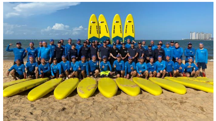
Representatives from the Haikou Emergency Centre with Australian life savers.

In Haikou, the Chair represented the Foundation at the first international training activity run in China by Surf Life Saving NSW & QLD. In partnership with the Haikou Emergency Centre, Surf Life Saving NSW & QLD delivered aquatic emergency training to 40 first responders from across China. The project was made possible through the Foundation's grant program and produced a bilingual aquatic rescue manual to aid future training and development for Chinese aquatic rescue responders.