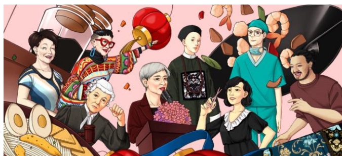
Makers Empire's cover illustration by Chinese Australian illustrator, Yushi Xie.

The Celebrating Chinese Australians program is available free to Australian primary schools throughout 2024.