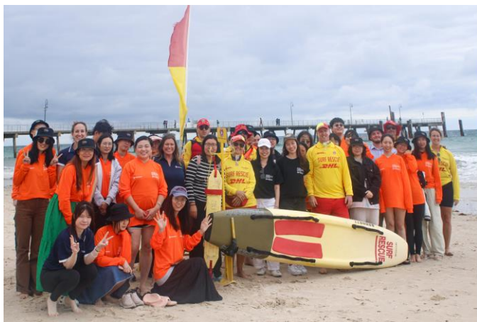
Beach Smarts participants learned water safety skills at Glenelg Beach