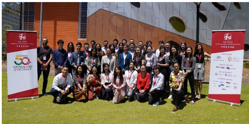
Delegates at the 12 th Australia-China Youth Dialogue

The Foundation supported the 12th Australia-China Youth Dialogue (ACYD 2022) - a track II dialogue to build people-to-people links between Australia and China and delivering the ACYD Alumni Program. The Dialogue - which was also an official 50th anniversary of diplomatic relations event - was held in Perth from 18 – 21 November 2022. It brought together emerging Australian and Chinese leaders from government, business, academia, media and the arts to discuss key aspects of the bilateral relationship. Topics covered included regional security and prosperity, mining and resourcing for the future, people-to-people links, community and the arts, and public diplomacy in practice. Speakers included Australian Ambassador to the People's Republic of China, H.E. Mr Graham Fletcher, Chinese Consul-General in Perth, Long Dingbin, Former Prime Minister of Australia the Hon Dr Kevin Rudd AC and Nobel Laureate Professor Barry Marshall.