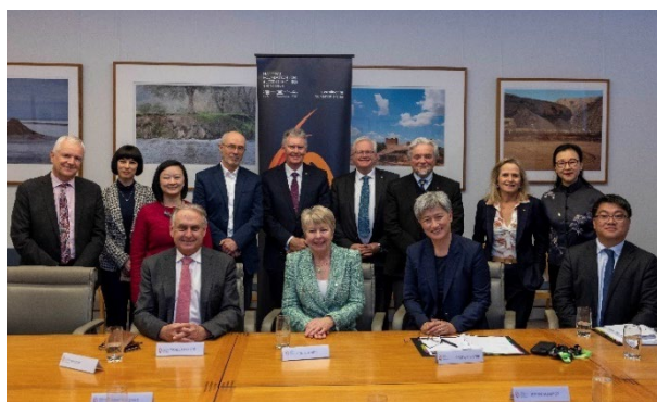
Advisory Board members with Foreign Minister Penny Wong and Trade and Tourism Minister Don Farrell.

The refreshed Advisory Board convened in Canberra in June 2023, meeting: the Minister for Foreign Affairs, Senator the Hon Penny Wong; Minister for Trade and Tourism, Senator the Hon Don Farrell; Assistant Minister for Foreign Affairs, the Hon Tim Watts MP; Minister for Immigration, Citizenship and Multicultural Affairs, the Hon Andrew Giles MP; and Ambassador of the People's Republic of China to Australia, H.E. Mr Xiao Qian.