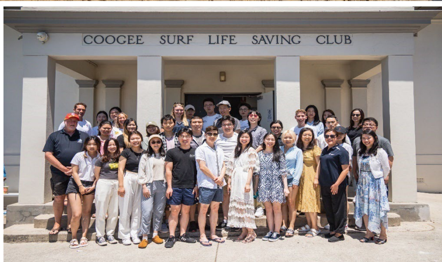
International students participating in the 'Beach Smarts for Life' program 2022 at Coogee.