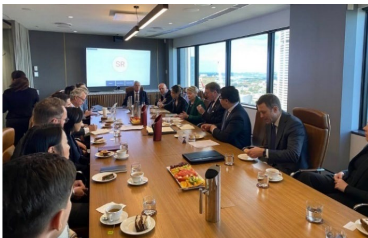
The China Economic Update hosted at Foundation HQ.

Attendees included senior business and government representatives.