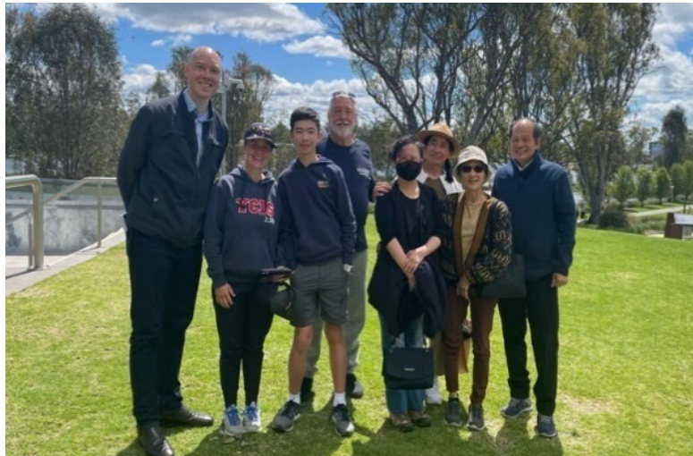
The Foundation with Shepparton community members