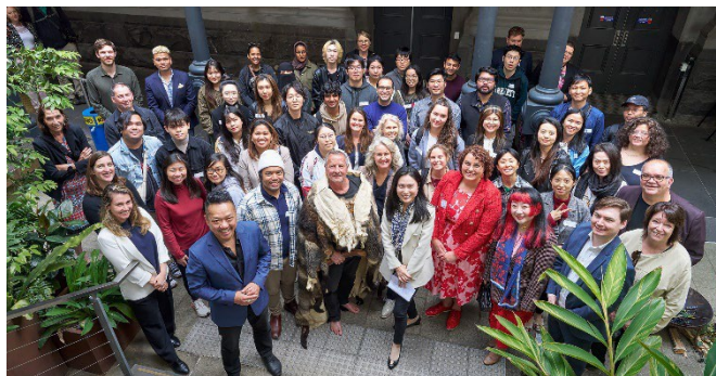
Embrace participants experienced a First Nations smoking ceremony.