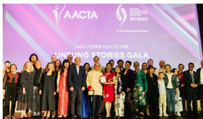
Attendees of the Unsung Stories Gala held at the Ritz Cinemas Randwick.

In October 2023, the Australian Academy of Cinema and Television Arts (AACTA) celebrated the vibrant tapestry of Chinese-Australian experiences with the Unsung Stories short film festival in Sydney. This Foundation-supported initiative provided a platform for Chinese-Australians from diverse backgrounds to share their personal narratives on the big screen. By giving a platform to these diverse voices, the Unsung Stories not only acknowledged the profound contributions Chinese-Australian communities have made to Australia's social fabric, but also ensured their preservation for future generations through AACTA's online archive .