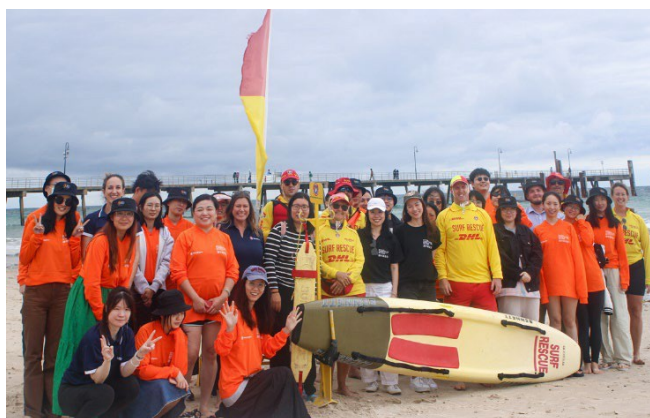
Beach Smarts participants learned water safety skills at Glenelg Beach

Tragically, a significant portion of Australia's coastal drowning deaths involve international visitors, with a high number coming from China. To address this and build connections between Chinese international students and the broader Australian community, the Foundation partnered with the Royal Life Saving Society South Australia in November 2023 to deliver the third instalment of the BeachSmarts program. The program educated 40 Chinese international students on water safety and CPR, equipped them with lifesaving skills and connected them to a unique part of Australian society. Minister for Emergency Services for South Australia, Joe Szakacs, attended the training session , SA Member for Morphett, Stephen Patterson MP, and Hon Russell Wortley MLC joined the students at Glenelg Beach and spoke about the importance of beach safety. SBS Chinese also interviewed participating students.