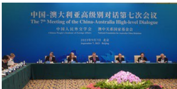
The 7th Australia-China High-Level Dialogue was held in Beijing.

In late September 2023, Foreign Minister Wong visited the Foundation's office in Sydney to thank staff for their work delivering the Dialogue.