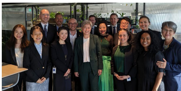
Foreign Minister Penny Wong visited Foundation office in September 2023.