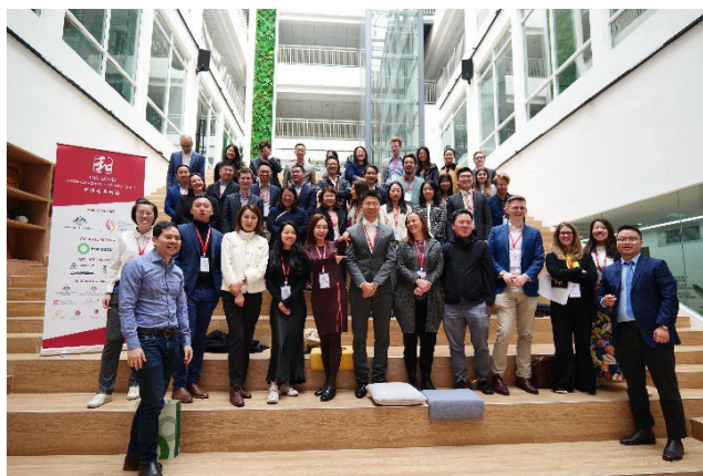
The ACYD delegation in Chengdu.

The Foundation is pleased to support ACYD and cultivate the next generation of informed and engaged professionals who will actively contribute to a constructive Australia-China relationship.