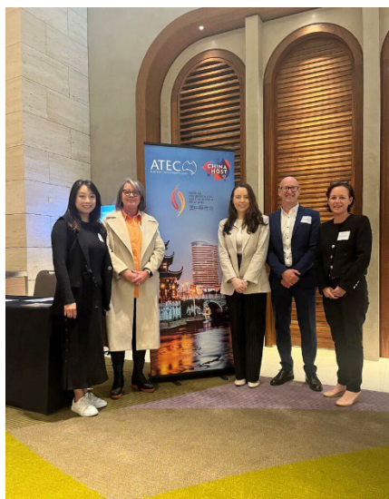
ATEC's China Host workshop training program launch, Perth.

China's outbound tourism industry presents a significant opportunity for Australia's visitor economy. Australia is investing in its tourism industry by supporting programs that cater to the growing outbound Chinese tourism market and help Australian businesses capture a share of this market.