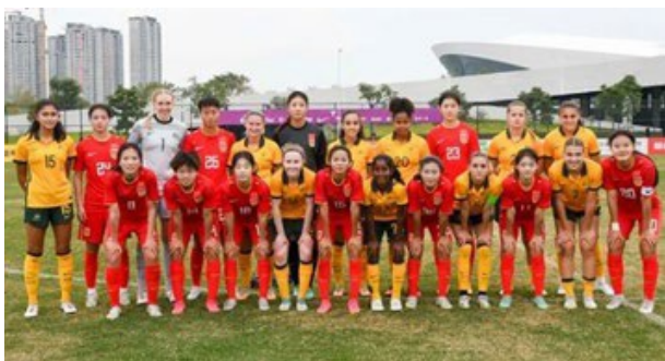
The Young Matildas in Xiamen.

In November 2023 the Young Matildas U20 team toured Xiamen, building skills with their Chinese counterparts in preparation for the Women's World Cup in 2027 and as Australia prepares to host the 2032 Summer Olympic Games in Queensland. The trip included visits to a local school , UNESCO World Heritage Site Gulangyu, and two livestreamed friendly matches .