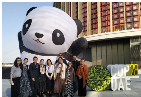
Australian and Chinese city officials at COP28 in Dubai, UAE.