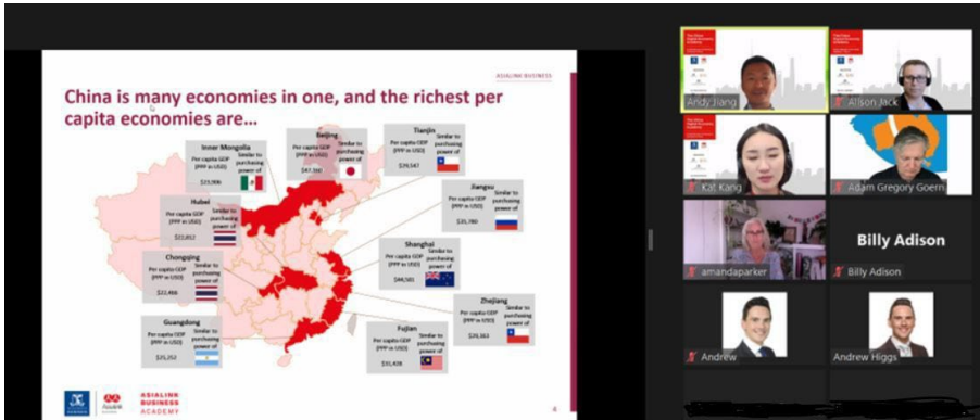
Asialink – The China Digital Economy Academy – online series Module 2.

Asialink's China Digital Economy Academy concluded its fourth and final round in October 2023. This program helped Australian small and medium-sized enterprises (SMEs) bolster their knowledge and capability to engage with China's booming e-commerce market. Over 300 organisations participated across the four rounds, gaining valuable insights into Chinese business culture, consumer behaviour, and digital marketing strategies. This initiative advanced Australia's national interest by empowering SMEs to tap into a vast market and foster stronger economic ties between Australia and China.