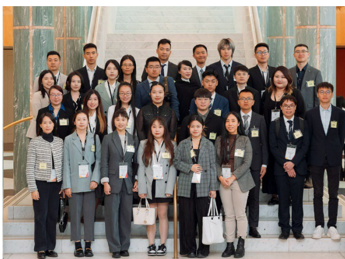
Inaugural 2023 Stephen FitzGerald Scholars Program participants.