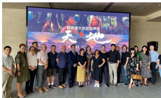
Ochre and Sky touring in China.

Showcasing First Nations' culture and the concept of Country, the National Museum of Australia's Ochre and Sky exhibition embarked on a roadshow across China in 2023 and 2024, supported by the Foundation.