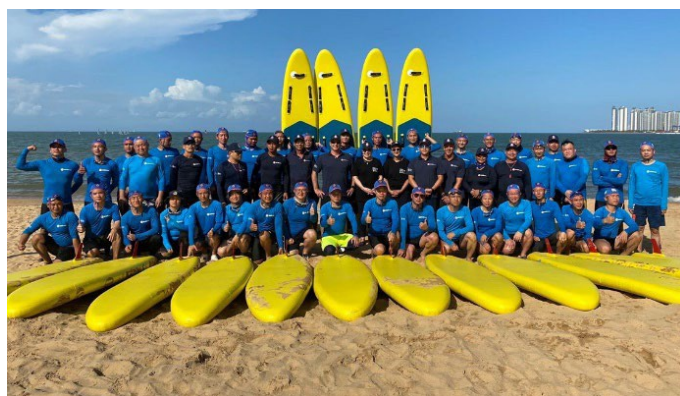
Surf Life Saving NSW & QLD delivered aquatic emergency training to frontline responders in November 2023 in Haikou, Hainan.

In Haikou, the Chairman represented the Foundation at the first international training activity run in China by Surf Life Saving NSW and QLD. In partnership with the Haikou Emergency Centre, Surf Life Saving NSW and QLD delivered aquatic emergency training to 40 first responders from across China. Additionally, they produced a bilingual aquatic rescue manual to support future training and development for Chinese emergency personnel.